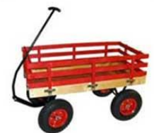
Wheel and Axle